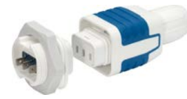
Set consisting of appliance inlet and connector