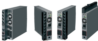
FlexPDU and HotSwap MBP can be mounted in many different positions.