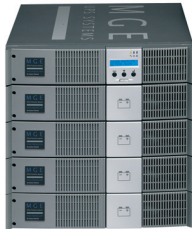
1 to 4 EXB battery units can be added to increase the backup time of either Pulsar 1000 or 1500 UPSs.