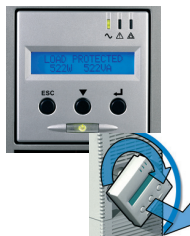
Adjustable multilingual display.