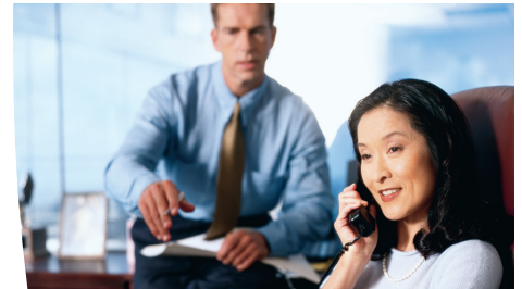
Telephony - VoIP.