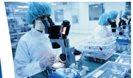
Medical equipment - Industrial processes.