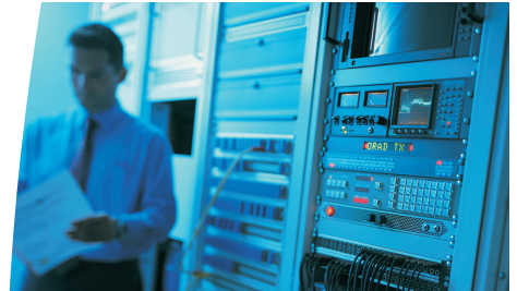
Servers, data storage and network equipment.