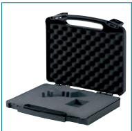
K2001 ESD Raster