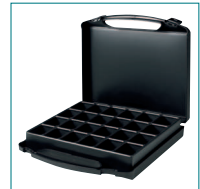
TE 24 K 6-10