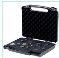
K2001 ESD Steckschaum