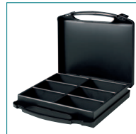
TE 6 K 1-6-10