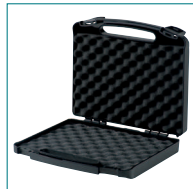
K2001 ESD Noppe