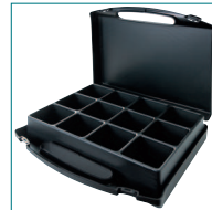
TE 12 K11-6-10