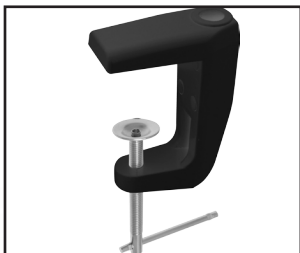
Heavy-Duty Mounting Clamp