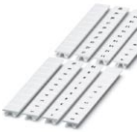
Zack marker strip, 10-section, horizontally labeled with the consecutive numbers: 21 ... 30, white, Width: 8 mm

Please be informed that the data shown in this PDF Document is generated from our Online Catalog. Please find the complete data in the user's documentation. Our General Terms of Use for Downloads are valid ( http://phoenixcontact.com/download )