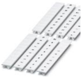
Zack marker strip, 10-section, horizontally labeled with the consecutive numbers: 31 ... 40, white, Width: 8 mm

Please be informed that the data shown in this PDF Document is generated from our Online Catalog. Please find the complete data in the user's documentation. Our General Terms of Use for Downloads are valid ( http://phoenixcontact.com/download )