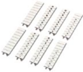
Zack marker strip, 10-section, horizontally labeled with the consecutive numbers: 21 ... 30, white, Width: 5 mm

Please be informed that the data shown in this PDF Document is generated from our Online Catalog. Please find the complete data in the user's documentation. Our General Terms of Use for Downloads are valid ( http://phoenixcontact.com/download )