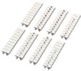
Zack marker strip, 10-section, horizontally labeled with the consecutive numbers: 31 ... 40, white, Width: 5 mm

Please be informed that the data shown in this PDF Document is generated from our Online Catalog. Please find the complete data in the user's documentation. Our General Terms of Use for Downloads are valid ( http://phoenixcontact.com/download )