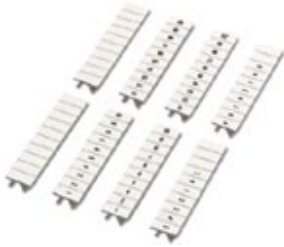
Zack marker strip, 10-section, horizontally labeled with the consecutive numbers: 41 ... 50, white, Width: 5 mm

Please be informed that the data shown in this PDF Document is generated from our Online Catalog. Please find the complete data in the user's documentation. Our General Terms of Use for Downloads are valid ( http://phoenixcontact.com/download )