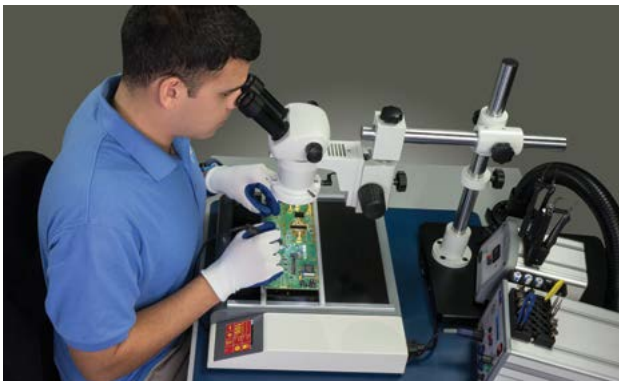
PH 100's sleek, ergonomic low-profile design is perfect for use under a microscope!

The PACE PH100 is a high powered (1600W), non-contact infrared heating system with an ergonomic, low-profile design which permits operators to safely pre-heat PCBs for fast, efficient soldering, rework or repair, even on the highest mass, heat-sinking, lead-free PCBs.