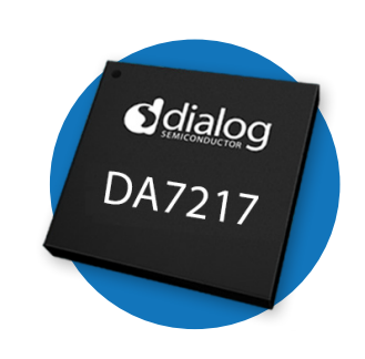
32 ball WLCSP package, 0.5 mm pitch

DA7217 contains two analog microphone input paths, or up to four digital microphone input paths, or a combination of both. The other chip in this family, the DA7218, has single-ended headphone outputs, and has been designed with headphone detect for use in accessories.