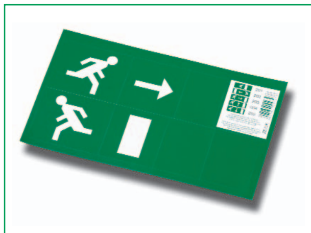
Zeta II legend kit