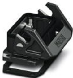
HEAVYCON EVO panel mounting base, plastic, B10, with single locking latch, height: 30.5 mm, with flat gasket

Please be informed that the data shown in this PDF Document is generated from our Online Catalog. Please find the complete data in the user's documentation. Our General Terms of Use for Downloads are valid ( http://phoenixcontact.com/download )