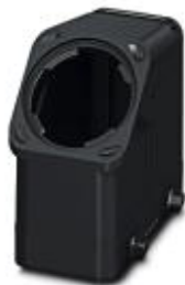
HEAVYCON EVO sleeve housing, plastic, with bayonet flange for EVO screw connection, B16, for double locking latch, height: 78 mm, without EVO screw connection

Please be informed that the data shown in this PDF Document is generated from our Online Catalog. Please find the complete data in the user's documentation. Our General Terms of Use for Downloads are valid ( http://phoenixcontact.com/download )