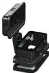
HEAVYCON EVO panel mounting base, plastic, B16, for double locking latch, height: 30.5 mm, with flat gasket, with protective cover

Please be informed that the data shown in this PDF Document is generated from our Online Catalog. Please find the complete data in the user's documentation. Our General Terms of Use for Downloads are valid ( http://phoenixcontact.com/download )