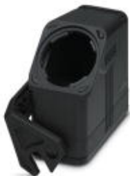
HEAVYCON EVO coupling housing, plastic, with bayonet flange for EVO screw connection, B16, with single locking latch, height: 81 mm, without EVO screw connection

Please be informed that the data shown in this PDF Document is generated from our Online Catalog. Please find the complete data in the user's documentation. Our General Terms of Use for Downloads are valid ( http://phoenixcontact.com/download )