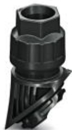
EVO plastic cable gland with bayonet locking, for housing series B, size M40, cable diameter: 9 ... 28 mm

Please be informed that the data shown in this PDF Document is generated from our Online Catalog. Please find the complete data in the user's documentation. Our General Terms of Use for Downloads are valid ( http://phoenixcontact.com/download )