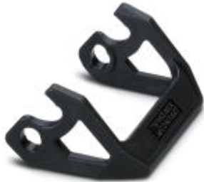
Replacement single locking latch for HEAVYCON EVO housing type B6, PA

Please be informed that the data shown in this PDF Document is generated from our Online Catalog. Please find the complete data in the user's documentation. Our General Terms of Use for Downloads are valid ( http://phoenixcontact.com/download )