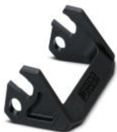
Replacement single locking latch for HEAVYCON EVO housing type B10, PA

Please be informed that the data shown in this PDF Document is generated from our Online Catalog. Please find the complete data in the user's documentation. Our General Terms of Use for Downloads are valid ( http://phoenixcontact.com/download )