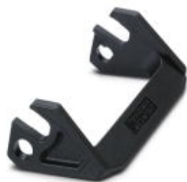
Replacement single locking latch for HEAVYCON EVO housing type B16, PA

Please be informed that the data shown in this PDF Document is generated from our Online Catalog. Please find the complete data in the user's documentation. Our General Terms of Use for Downloads are valid ( http://phoenixcontact.com/download )