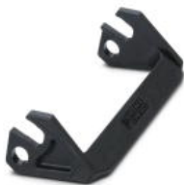
Replacement single locking latch for HEAVYCON EVO housing type B24, PA

Please be informed that the data shown in this PDF Document is generated from our Online Catalog. Please find the complete data in the user's documentation. Our General Terms of Use for Downloads are valid ( http://phoenixcontact.com/download )