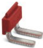
Insertion bridge, Pitch: 6.15 mm, Number of positions: 2, Color: red

Insertion bridge - EB 2- DIK RD - 2716693