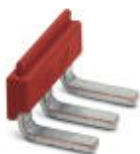
Insertion bridge, Pitch: 6.15 mm, Number of positions: 3, Color: red

Insertion bridge - EB 3- DIK RD - 2716745