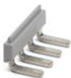
Insertion bridge, Pitch: 6.15 mm, Number of positions: 4, Color: red

Insertion bridge - EB 4- DIK RD - 2716758