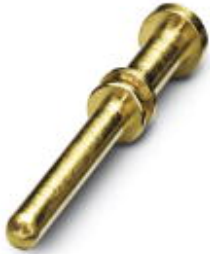
Crimp contact, turned, Single contact, Contact diameter: 2 mm, Crimp range: 0.25 mm 2 ...1 mm 2

Please be informed that the data shown in this PDF Document is generated from our Online Catalog. Please find the complete data in the user's documentation. Our General Terms of Use for Downloads are valid ( http://phoenixcontact.com/download )