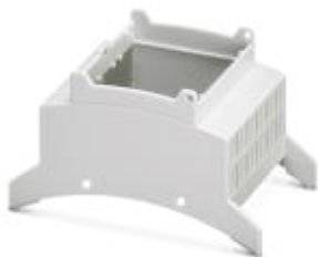
Installation component housing, Upper part, Color: light gray, Width: 53.6 mm, Constructional height: 62.2 mm

Please be informed that the data shown in this PDF Document is generated from our Online Catalog. Please find the complete data in the user's documentation. Our General Terms of Use for Downloads are valid ( http://phoenixcontact.com/download )