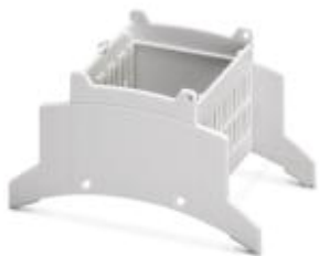
Installation component housing, Upper part, Color: light gray, Width: 53.6 mm, Constructional height: 62.2 mm

Please be informed that the data shown in this PDF Document is generated from our Online Catalog. Please find the complete data in the user's documentation. Our General Terms of Use for Downloads are valid ( http://phoenixcontact.com/download )