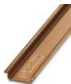
DIN rail, material: Copper, unperforated, height 7.5 mm, width 35 mm, length: 2 m

DIN rail, unperforated - NS 35/ 7,5 CU UNPERF 2000MM - 0801762