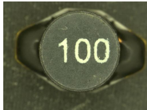
Marking with Pad-Printing