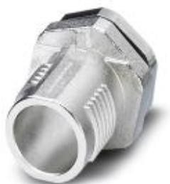
M12 SPEEDCON housing screw connection for M12 male inserts, with O-ring, for all SPEEDCON-capable THR and wave soldering contact carriers

Please be informed that the data shown in this PDF Document is generated from our Online Catalog. Please find the complete data in the user's documentation. Our General Terms of Use for Downloads are valid ( http://phoenixcontact.com/download )