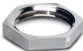
Flat nut with Pg9 thread

Please be informed that the data shown in this PDF Document is generated from our Online Catalog. Please find the complete data in the user's documentation. Our General Terms of Use for Downloads are valid ( http://phoenixcontact.com/download )