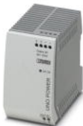
Primary-switched UNO POWER power supply for DIN rail mounting, input: 1-phase, output: 24 V DC/100 W

Please be informed that the data shown in this PDF Document is generated from our Online Catalog. Please find the complete data in the user's documentation. Our General Terms of Use for Downloads are valid ( http://phoenixcontact.com/download )