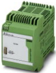
Energy storage device, lead AGM, VRLA technology, 12 V DC, 1.6 Ah.

Please be informed that the data shown in this PDF Document is generated from our Online Catalog. Please find the complete data in the user's documentation. Our General Terms of Use for Downloads are valid ( http://phoenixcontact.com/download )