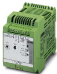
Uninterruptible power supply with integrated power supply unit, 2 A, in combination with MINI-BAT/24/DC 0.8 AH or 1.3 AH

Please be informed that the data shown in this PDF Document is generated from our Online Catalog. Please find the complete data in the user's documentation. Our General Terms of Use for Downloads are valid ( http://phoenixcontact.com/download )