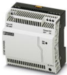
Primary-switched STEP POWER power supply for DIN rail mounting, input: 1-phase, output: 48 V DC/2 A

Please be informed that the data shown in this PDF Document is generated from our Online Catalog. Please find the complete data in the user's documentation. Our General Terms of Use for Downloads are valid ( http://phoenixcontact.com/download )