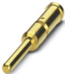
Crimp contact, turned, Contact diameter: 2 mm, Crimp range: 1.5 mm 2 ...2.5 mm 2

Please be informed that the data shown in this PDF Document is generated from our Online Catalog. Please find the complete data in the user's documentation. Our General Terms of Use for Downloads are valid ( http://phoenixcontact.com/download )