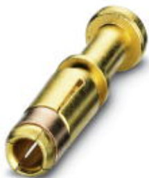
Crimp contact, turned, Single contact, Contact diameter: 2 mm, Crimp range: 1 mm 2 ...2.5 mm 2

Please be informed that the data shown in this PDF Document is generated from our Online Catalog. Please find the complete data in the user's documentation. Our General Terms of Use for Downloads are valid ( http://phoenixcontact.com/download )