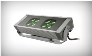
LED Wall Washer