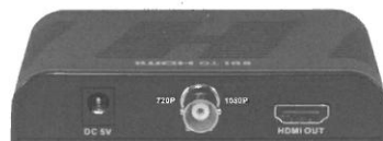
SDI TO HDMI Converter