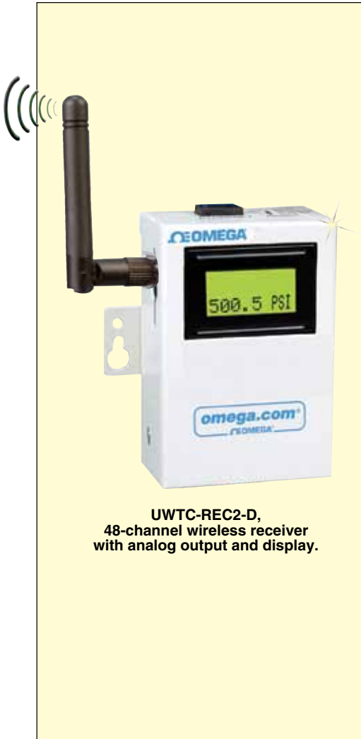
UWTC-REC2-D, 48-channel wireless receiver with analog output and display.

The DPG configuration wizard provides a convenient USB interface with your device. Please refer to the manual for details on setting up your device.