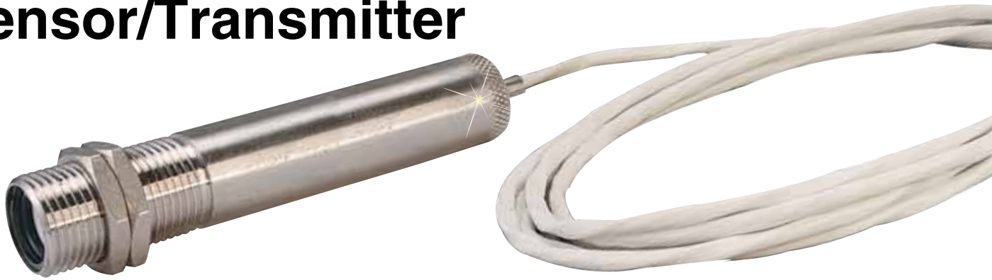
OS136 miniature stainless steel sensor/transmitter with NEMA 4 housing shown actual size.

Each unit includes 2 hex mounting nuts, 1.8 m (6') shielded cable and operator's manual.