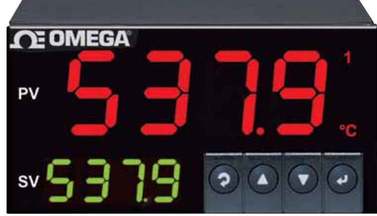
Connect your OS137 to a precision controller model CNi8DH, sold separately.