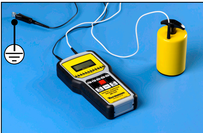
Figure 5. Rg test setup

If the measurement is outside acceptable limits, clean the surface with an ESD cleaner containing no insulative silicone such as Rezfore™ Antistatic Surface & Mat Cleaner , and re-test to determine if the cause of failure is an insulative dirt layer or the ESD worksurface material.