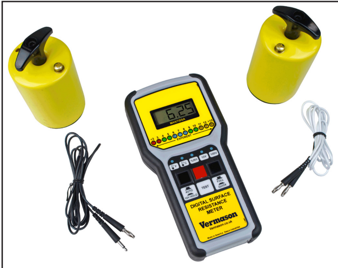
Figure 1. Vermason Digital Surface Resistance Meter Kit