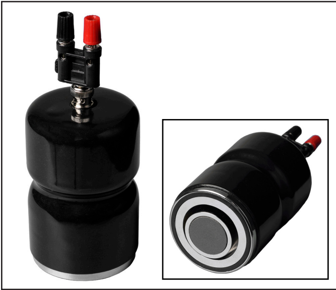
Figure 7. Vermason 222002 Concentric Ring Probe

The Vermason 222002 Concentric Ring Probe is an instrument to be used in conjunction with a resistance meter, such as the Vermason 222643 Digital Surface Resistance Meter, to measure surface resistance per EN 61340-5-1 Table 4 Packaging of solid planar materials.