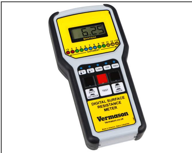
Figure 3. Vermason 222643 Digital Surface Resistance Meter