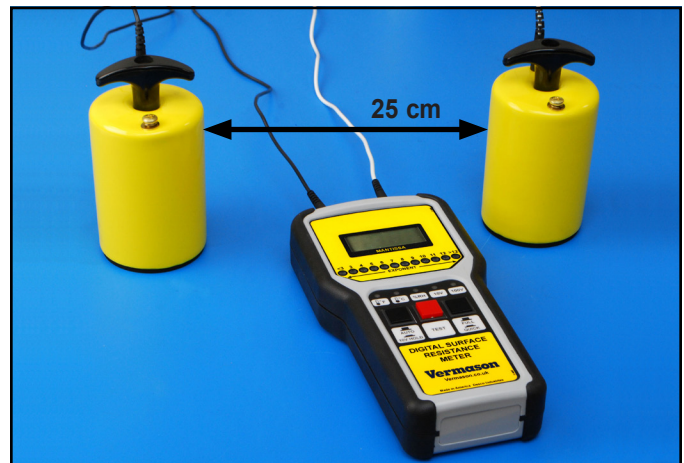
Figure 6. Rp-p test setup - set the electrodes about 25 cm apart for working surfaces and about 1 m apart for flooring

If the measurement is outside acceptable limits, clean the surface with an ESD cleaner containing no insulative silicone such as Rezfore™ Antistatic Surface & Mat Cleaner , and re-test to determine if the cause of failure is an insulative dirt layer or the ESD worksurface material.