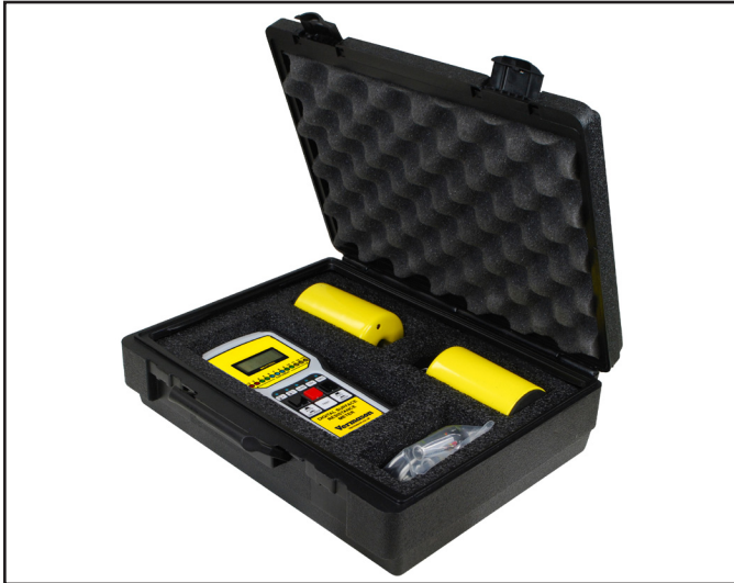
Figure 2. Vermason 222642 Digital Surface Resistance Meter Kit