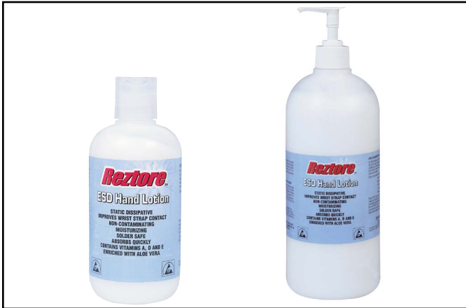
Figure 1. Rezto™ ESD Hand Lotion