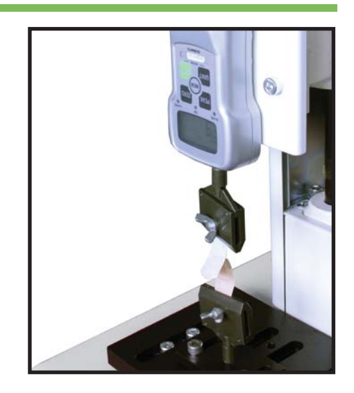
Stand with Optional Grip Performing Peel Test