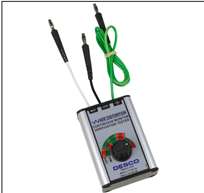
Figure 6. Desco 98221 Wave Distortion Monitor Verification Tester