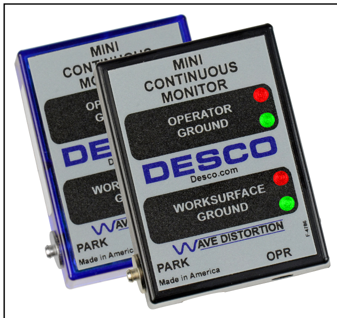
Figure 1. Desco Mini Monitor