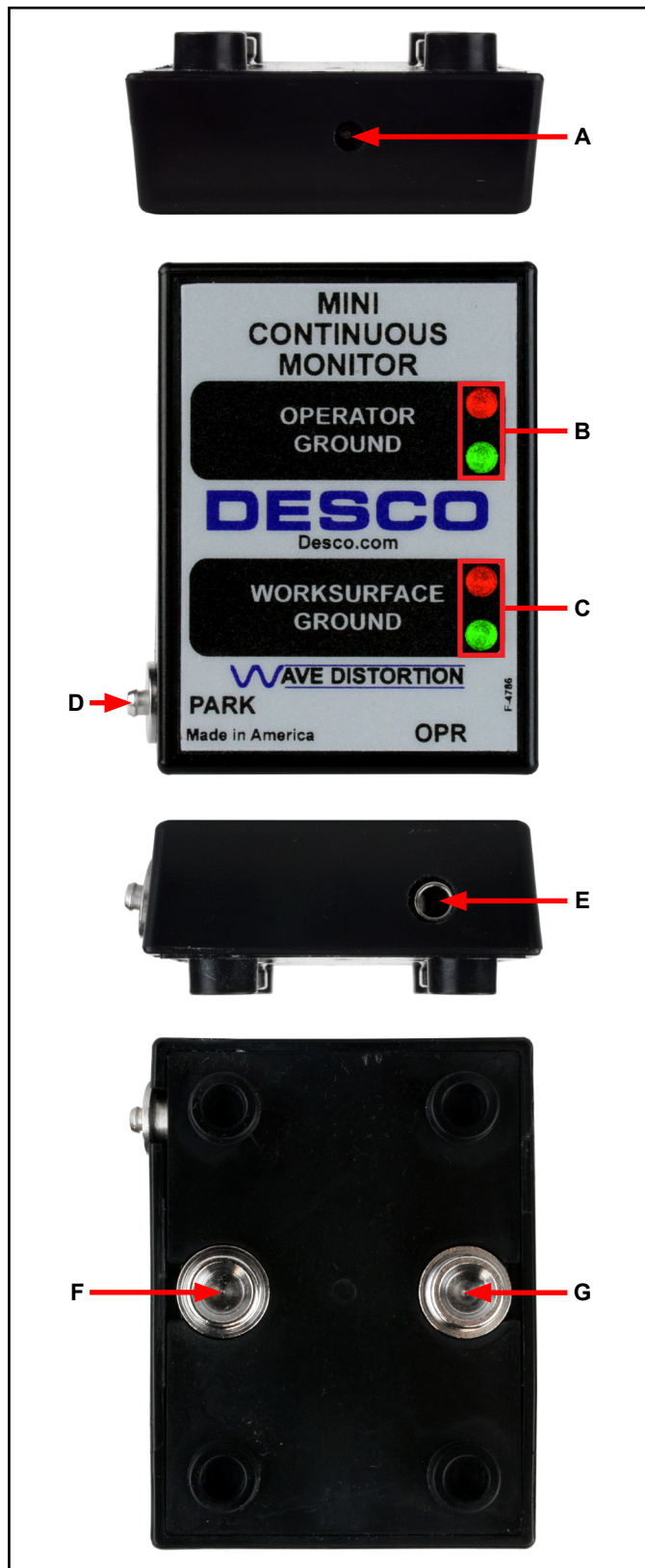
Figure 2. Mini Monitor features and components

A. Power Jack: Connect the included 24VDC power adapter here.