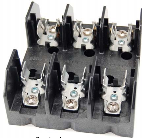
3 pole shown