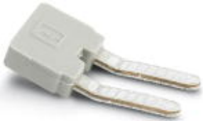
The figure shows the 2-position version

Insertion bridge, fully insulated, for connectors with 5.0 or 5.08 mm pitch, no. of positions: 6