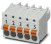
Plug component, nominal current: 8 A, rated voltage (III/2): 160 V, number of positions: 5, pitch: 3.81 mm, connection method: Push-in spring connection, Color: gray, contact surface: Tin

Printed-circuit board connector - FK-MCP 1,5/ 5-ST-3,81 GY - 1884005