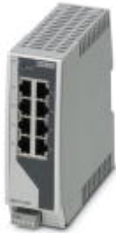
Managed Switch 2000, 8 RJ45 ports 10/100 Mbps, degree of protection IP20

Please be informed that the data shown in this PDF Document is generated from our Online Catalog. Please find the complete data in the user's documentation. Our General Terms of Use for Downloads are valid ( http://phoenixcontact.com/download )