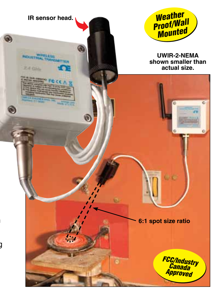
Monitoring temperature of heating coil on an induction welder.

Response Time: 100 ms (0 to 63% of final value) Emissivity Range: 0.1 to 1.00, adjustable