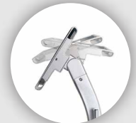
Adjustable viewing angle