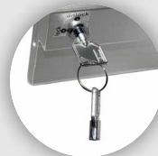
Anti-Theft lock with key